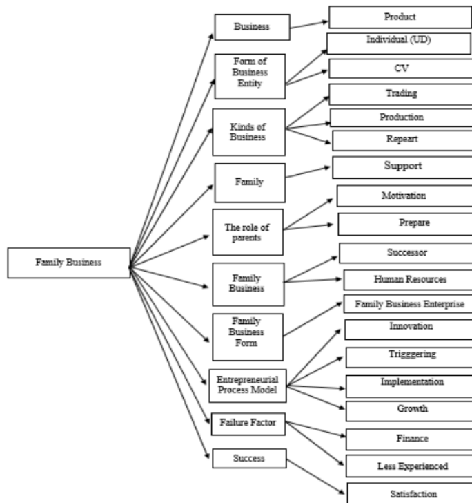
Figure 2. Concept Prepositions and Categorization of Success in Business