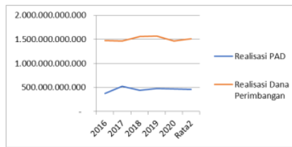
Figure 1. Fluctuations in The Realization of PAD and Balance Fund

Based on formulas (Mahmudi., 2010) then the results of the independence analysis are as follows: